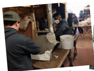
Prince's Trust making ovens