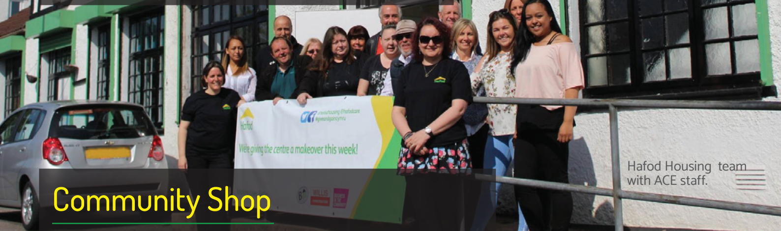
Hafod Housing team with ACE staff.