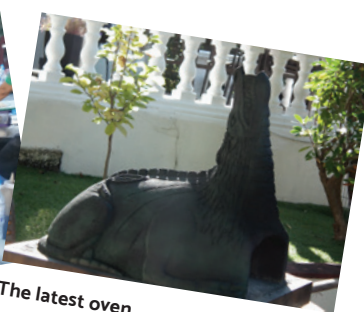
The latest oven

It's been a year since the inception of the wood fired pizza oven project. The idea was suggested by an arts organisation in Roath and the inspiration of the dragon theme came from an ACE staff member - Nerys. The oven proved a creative tool for engaging the community by offering free food to people at events and street based outreach sessions.